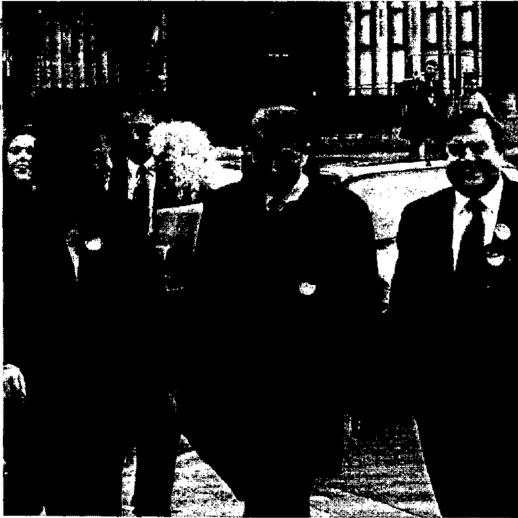
With [REDACTED] at the start of the General Election Campaign in Hull 2005